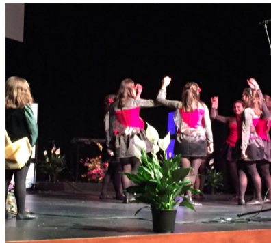
Stanford School of Irish Dance